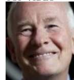
New governor general gives his view of the job