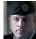
Soldier kicked out of Forces after shooting