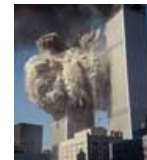
911 a look back