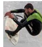
Week in Pictures Sept. 4-10